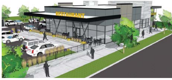
Single Tenant Plan with Patio